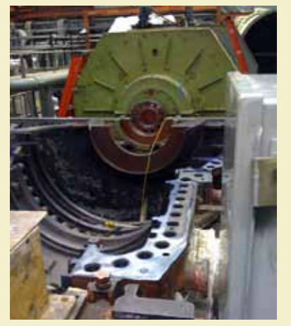
Crews at the Beluga Power Plant have dismantled Unit No. 8 for an annual inspection.

Unit 8 is the only steam unit on the Chugach system. While it is down {800020} for maintenance, Chugach will need to buy fuel for a natural gas turbine to replace the steam-powered generation. It costs about $80,000-100,000 per day for additional gas while Unit 8 is unavailable.