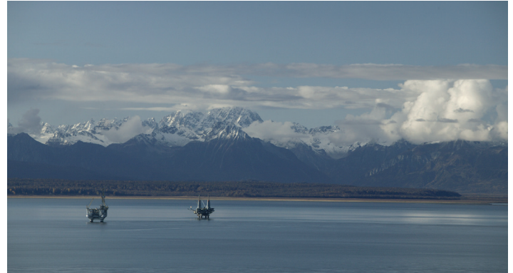
Marathon is a major producer of Cook Inlet natural gas.

The contract uses a pricing mechanism tied to the New York Mercantile Exchange Index of futures gas contract prices. The price varies by contract period, type of gas (base, swing or excess) and deliverability commitment. The contract contains a price collar (which sets a floor and ceiling price), initially established at $5.90 to $8.90 per thousand cubic feet, or MCF. Chugach's current average price for gas is around $4 per MCF. In 2009 Chugach's gas prices