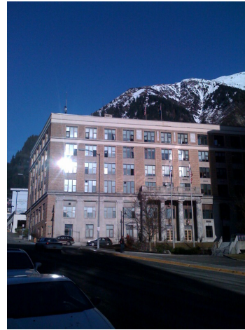
Alaska State Capitol