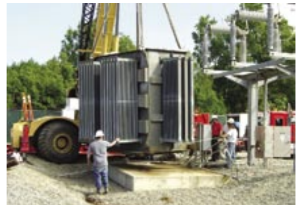
Chugach crews guided the reactor as it was moved from a concrete pad in the Pt. Woronzof Substation to a truck that brought the piece of equipment to Chugach's operations yard earlier this year.

The repaired reactor is one of two that were installed at the Pt. Woronzof Substation in 1971. Chugach