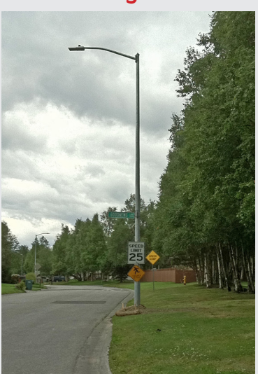
In August, Chugach oversaw the conversion of several dozen high-pressure sodium streetlights in Bayshore to new LED lights. The project was jointly funded by the state of Alaska, Municipality of Anchorage and Chugach.