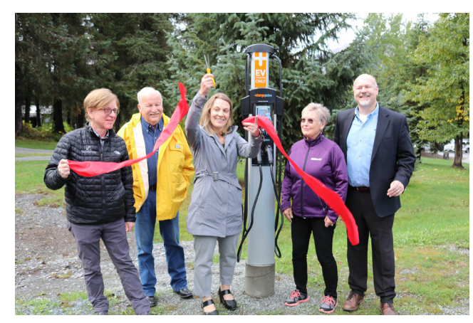
Charging station ribbon cutting at Alyeska Resort

will receive three years of charging data from the commercial partner.