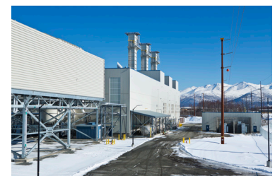
Southcentral Power Project

Chugach's Southcentral Power Project saves 80,000 tons of CO2 per year compared to operating the older Beluga Power Plant. This is equal to the CO2 reduction from all Chugach's hydro power plants per year.