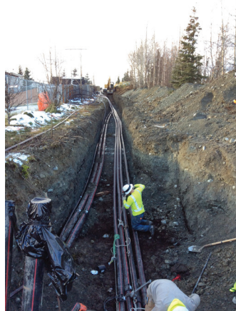
Dowling Road undergrounding

Chugach has two undergrounding projects underway. Along the Old Seward Highway, from Tudor Road to East 55th Street, approximately a half-mile of 3-phase overhead distribution lines is being moved underground. Along Dowling Road, from Elmore to Lake Otis, roughly one mile of distribution and sub-transmission overhead lines are being undergrounded. Both of the projects will improve system capacity for existing and new load growth, as well as improve overall reliability.