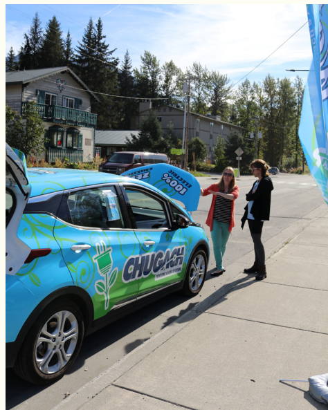
Watson in Girdwood

Watson, Chugach's Electric Vehicle, was on display at various locations for members and the public to stop and hear about the benefits of electric vehicles.