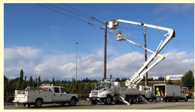
Chugach crews put in a power pole and relocated guy wires on the east side of Minnesota Drive to mitigate conflicts with the road extension project underway this summer.