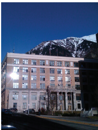
Alaska State capital building, Juneau

The legislature's Web site provides tools to allow the public to search for bills, follow their progress and contact legislators. To get started, go to http://w3/legis.state.ak.us/index.php and type a bill number or key word(s) into the search box.