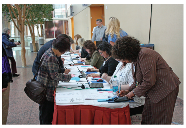
A total of 233 members registered at the 2010 annual meeting

Chugach uses natural gas from the Cook Inlet Basin to generate about 90 percent of the kilowatthours it sells annually. In 2009, Chugach purchased 26 BCF of gas. In addition to generating