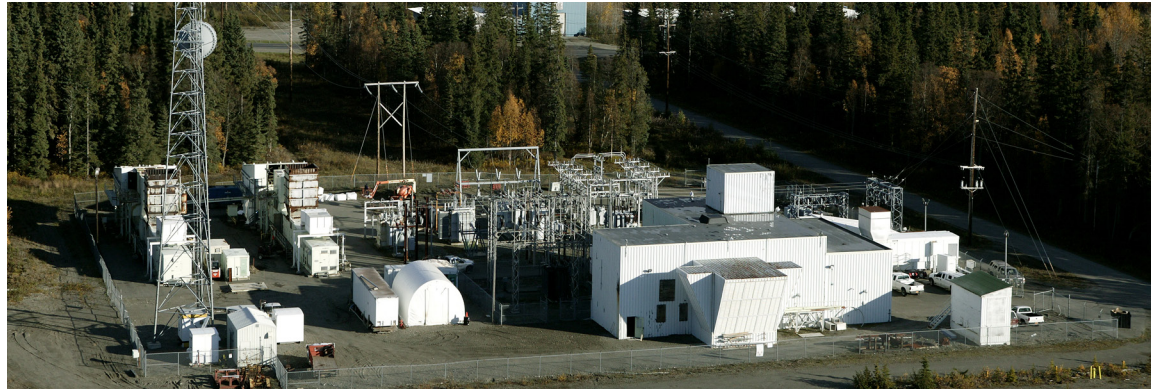
The first Bernice Lake Power Plant unit was commissioned in 1963.

HEA has agreed to pay Chugach $11.8 million for the plant.