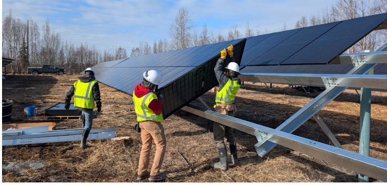
Construction is in full swing on Chugach's Community Solar Project, located near Retherford Substation on E 94th Ave. in Anchorage.

The Regulatory Commission of Alaska has approved the community solar tariff filing, giving Chugach members the opportunity to subscribe to Chugach Community Solar. If you're a current Chugach member, you're eligible to participate. This program is open to all retail members, including residential, small general service, and large general service members.