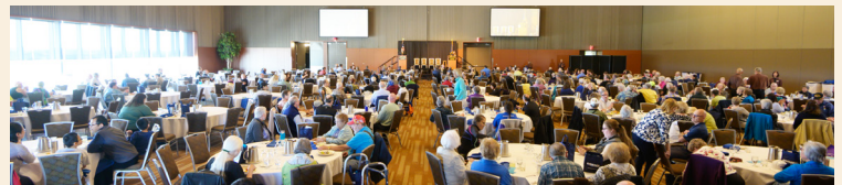
Chugach Annual Meeting 2019

Two candidates will be elected to four-year terms on