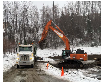
Removal and remediation of site at Sullivan Power Plant

In late 2025, crews removed the tanks, associated piping, and related infrastructure. Full ground remediation is underway and scheduled for completion in early 2026.