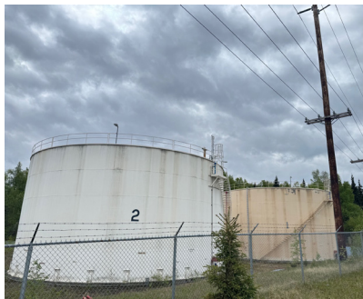
The retired diesel tanks at Sullivan Power Plant prior to removal

The tanks, installed in the 1980s and retired in 2015, had been emptied and cleaned before remaining idle for several years. Their removal fulfills a key remediation commitment by Chugach.