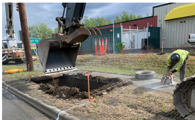
Excavation south of Klatt Road for the undergrounding of overhead conductors on the Old Seward Highway.

There are two sections of line Chugach is working to rebuild for this project. The Summit Lake to Daves Creek section is tentatively scheduled to begin in Jan. 2023. The Indian to Girdwood section is tentatively scheduled for 2023/2024 construction.