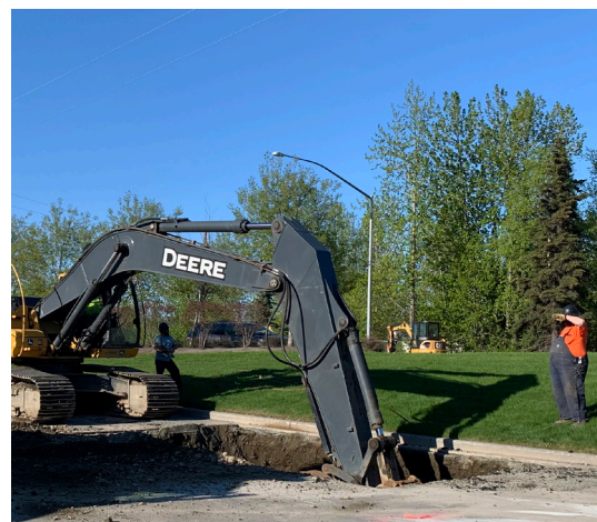
Excavation for the Old Seward undergrounding project between Huffman and O'Malley roads.

This project will reconstruct approximately four miles of line