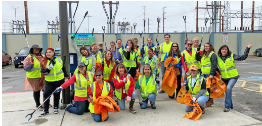
South District crew

Chugach employees spread out across three of our work sites picking up trash as part of the Anchorage Chamber of Commerce Citywide Cleanup program. We enjoy taking part in this annual tradition of sprucing up the city for summer.