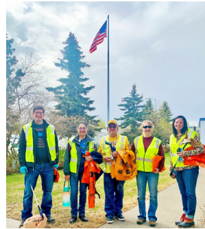
North District crew