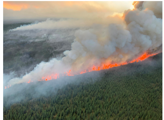
The Swan Lake fire on the Kenai Peninsula in 2019

A PSPS would only be considered during extreme conditions when the risk of wildfire ignition outweighs the impacts of a temporary outage. Like other emergency preparedness efforts, planning ahead helps ensure we are ready to respond safely. {141013778}