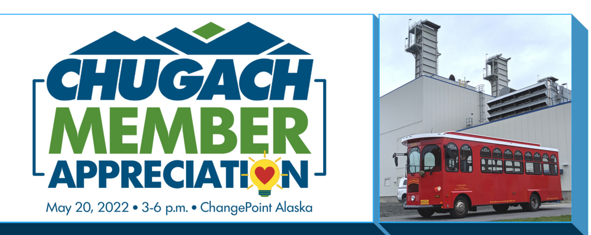
Join us for family fun, food and games. Reserve a seat on a power plant tour at chugachelectric.com.

To sign-up for the virtual option, please go to www.chugachelectric.com/media/ annual-meeting-election. Those attending the meeting in person will be eligible to win door prizes and enter a drawing for a surplus Chugach vehicle. {191301062}