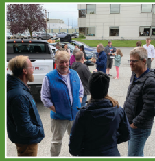
Event attendees, including local EV owners, were able to connect and share information