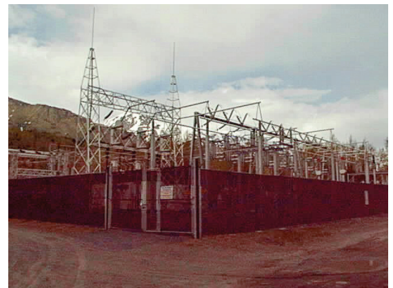
In 2013 thieves stole copper ground wires from the Daves Creek Substation near Cooper Landing.

Chugach and other organizations will be seeking legisla-