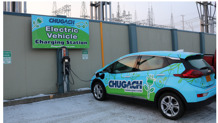
Wattson charging at Chugach headquarters