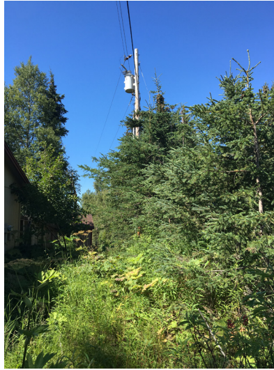
Not cleared right-of-way