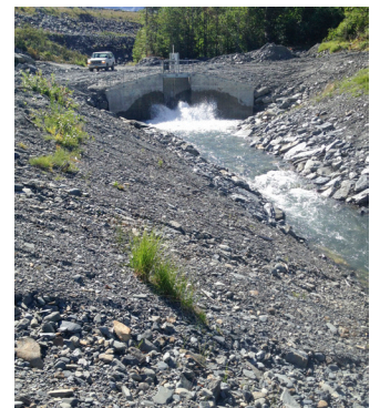
Stetson Creek diversion

Chugach diverted Stetson Creek into Cooper Lake and reduced CO2 emissions by 1,905 tons per year.