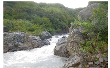
Battle Creek diversion site

A proposed project: Diverting Battle Creek into Bradley Lake at the Bradley Lake Hydroelectric Project could save about 2 million dollars of natural gas cost and 13,000 tonnes of CO 2 each year.