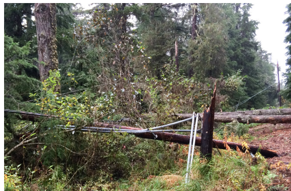
Damages in Girdwood from the Sept. 20 storm took several hours to repair.

Members can follow Chugach on Facebook and Twitter, and keep track of the outage map on our website at www.chugachelectric.com during any major weather event impacting power.