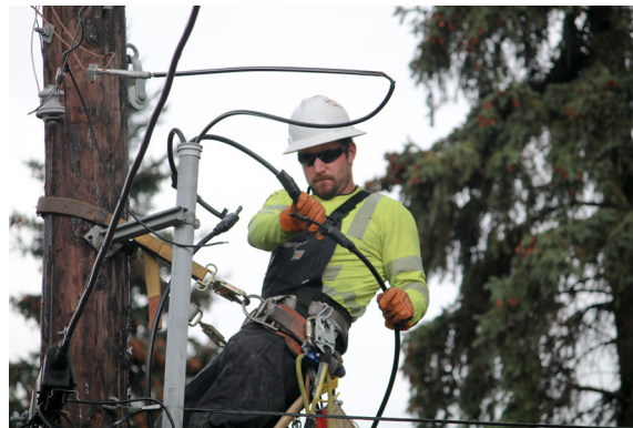
A lineman replaces a damaged transformer after the Sept. 11 storm.

Two wind storms blew through Southcentral Alaska in September, bringing outages to Chugach members. The first storm hit the afternoon of September 11 and continued into the next day. In total, approximately 3,300 members were impacted primarily on the Hillside and in the Jewel/Sand Lake areas. Most outages were attributed to wind damaged trees in contact with overhead lines.