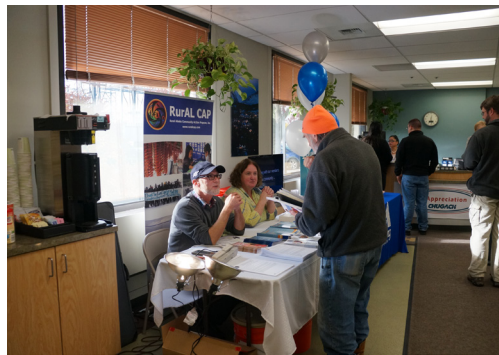
Learn ways to be energy efficient

of October 10, members can enter the drawing in the Chugach Lobby or at chugachelectric.com . The winner will be contacted via email during the week of October 17.