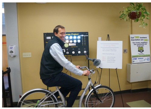
Take a ride on the Energy Bike

of October 10, members can enter the drawing in the Chugach Lobby or at chugachelectric.com . The winner will be contacted via email during the week of October 17.