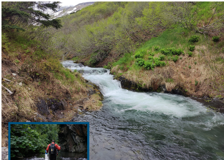
Top: Stetson Creek Diversion